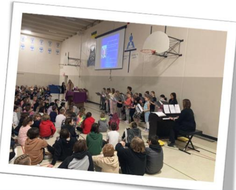
St. Bernadette Advent Liturgy

St. Dominic: Our Advent Angel Tree is ready for our Sharks to take an Angel home and replace it with an ornament after donating a greatly needed item for the Marian Centre Regina.