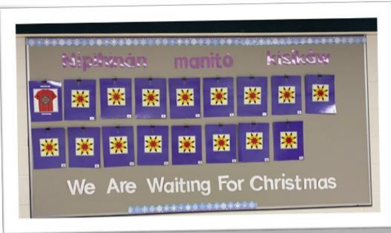
St. Francis Indigenous Advent Calendar: