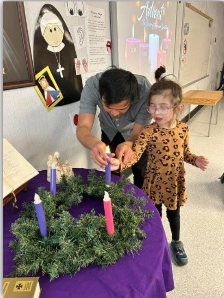
St Maria Faustina – light the advent Candle one: